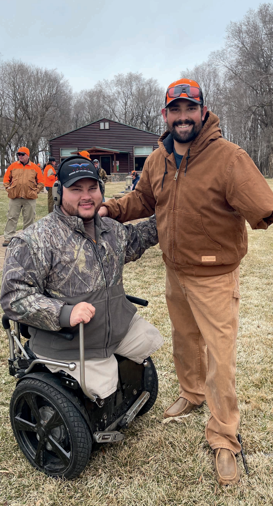
Veterans enjoying their stay at Wings of Valor.