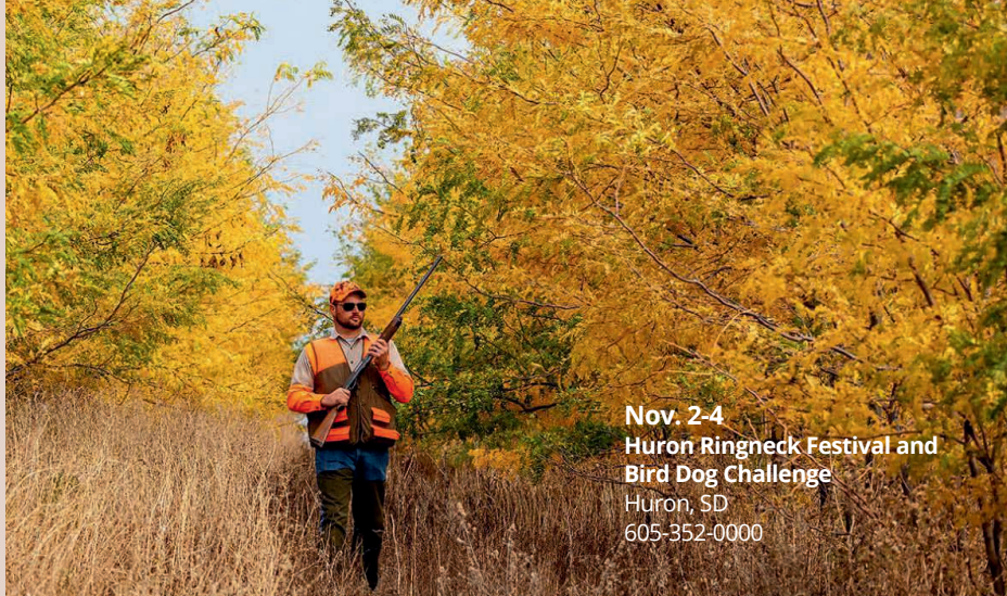
Nov. 2-4 Huron Ringneck Festival and Bird Dog Challenge Huron, SD 605-352-0000

To have your event listed on this page, send complete information, including date, event, place and contact to your local electric cooperative. Include your name, address and daytime telephone number. Information must be submitted at least eight weeks prior to your event. Please call ahead to confirm date, time and location of event.