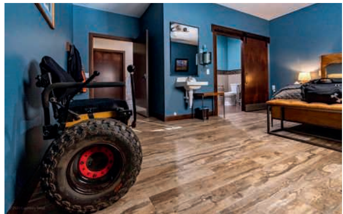
A handicap accessible bedroom at Wings of Valor lodge

To apply for a hunt or learn more about Wings of Valor Lodge, go to www.wingsofvalorlodge.org .