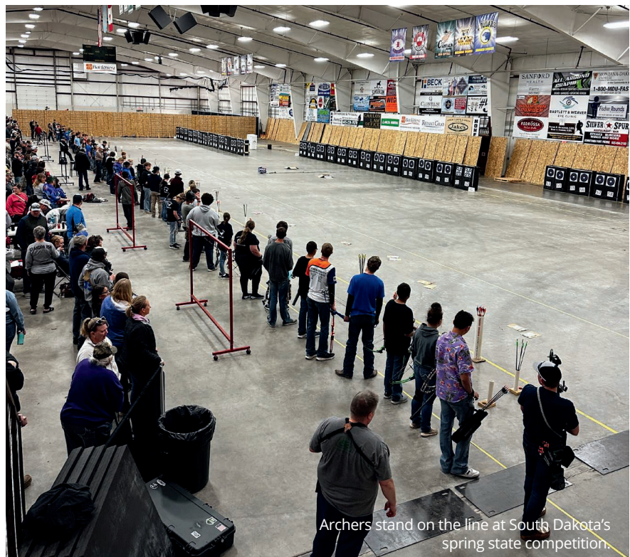
Archers stand on the line at South Dakota’s spring state competition.